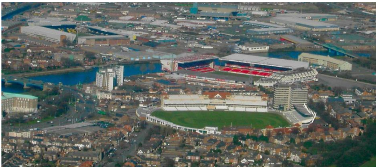
Three of their former grounds The Meadows, Trent Bridge and Castle Cricket ground (Notts forest FC) and today's Meadow Ground