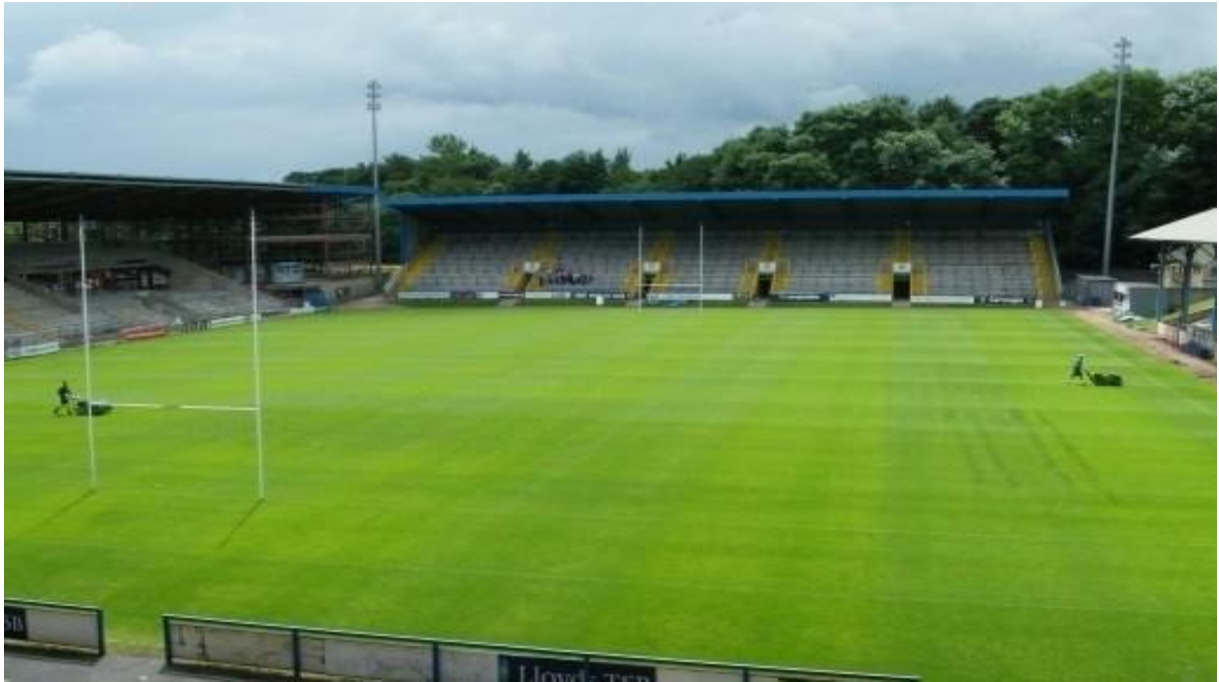
Main and South Stand