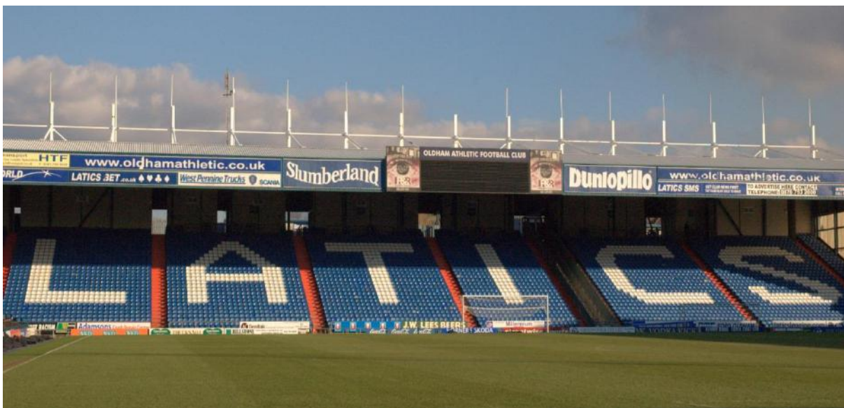
Jimmy Fizzell Stand

This used to have a paddock terracing in front, but has since been filled with seating. There is still some old unused terracing on the right side of this stand. The ground also benefits from four large traditional floodlight pylons.