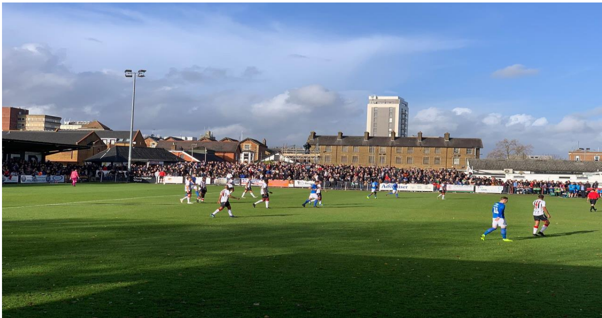
Bowling End/ York Road

The ground is a five minute walk away from the Maidenhead Railway Station when you come out of the station turn left and walk up King Street past the clock tower till you get to the Bell pub there cross the road and turn right into Queens Road when you get to the Honeypot Arms pub turn right and walk down York Road the ground is on the right, down the lane just before the Bowling Green. Those coming from the station should take the first right into Bell Street and use the turnstile in Bell Street for segregated games.