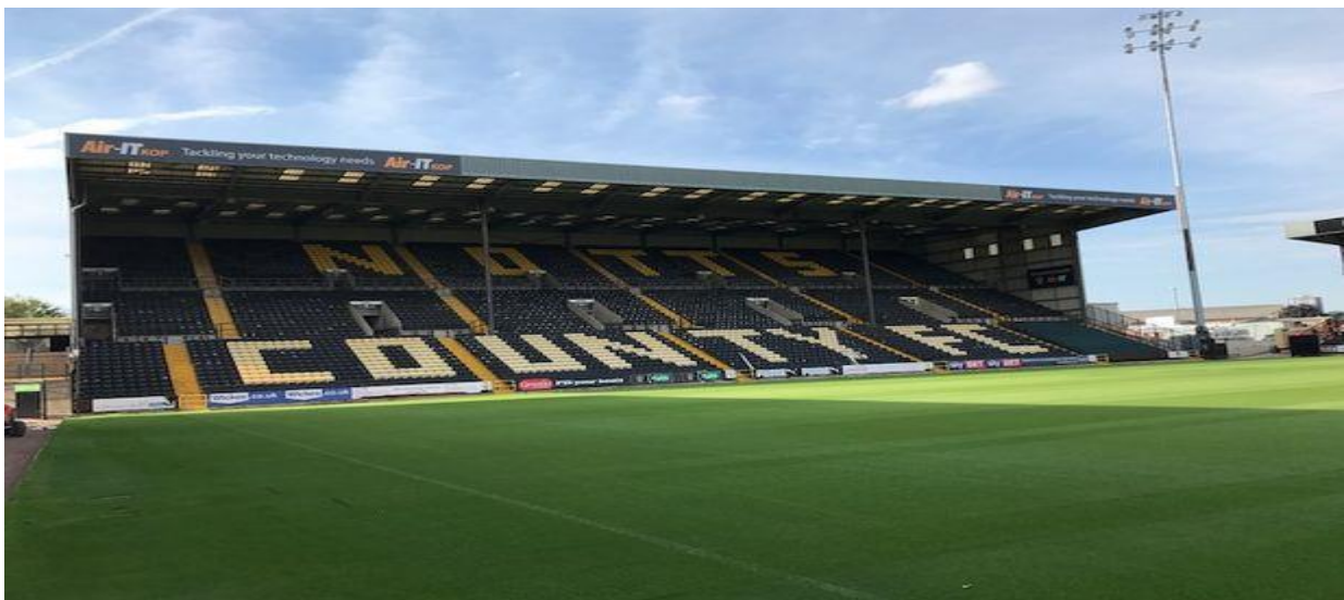
Kop End Stand

Leave the M1 at Junction 26 and take the A610 towards Nottingham and then signs for Stapleford and Nottingham and at the roundabout take the first exit and follow the road to the City Centre in Nottingham at the Upper Parliament roundabout take second exit and follow the sign for the station into Maid Marian Way and keep in the left lane after St Nicholas church then at the roundabout take the second exit onto London Road and then after the railway bridge take the second left into County Lane with the ground on your right.