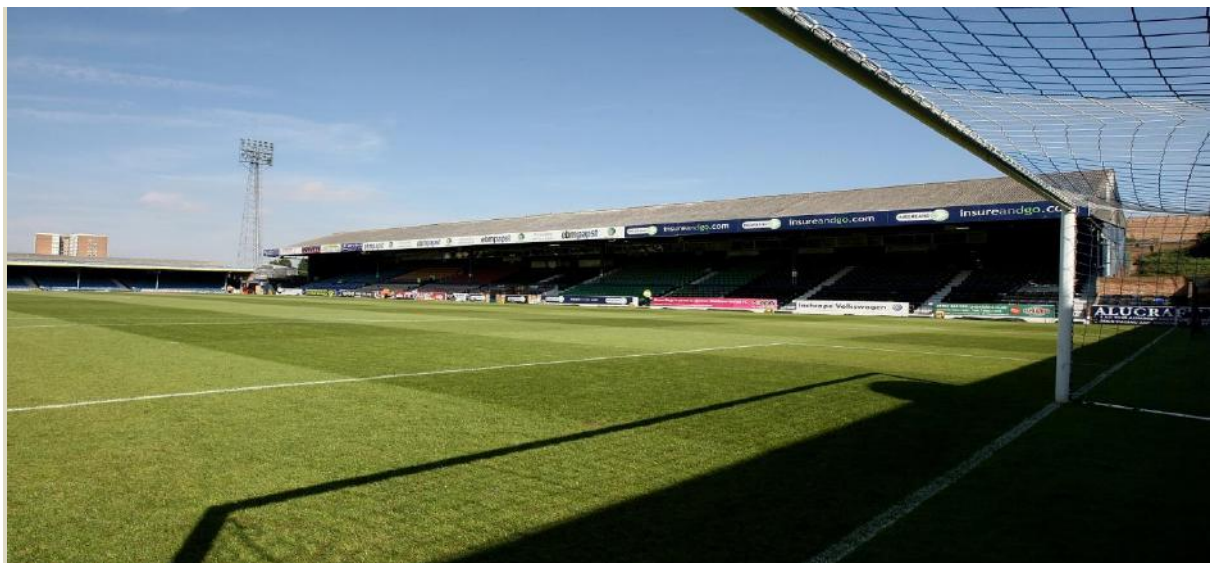
East Stand & North Stand

The East stand is the main stand at Roots Hall, running along one side of the pitch. Originally designed as a section of seating with paddocks of terracing below, it was converted to an all seater stand in the 1990s. The stand also contains executive boxes and, in the back, the Club offices. The dugouts are cut into the stand, covered by the main roof. The stand was originally much smaller and evidence of its extension along the touchline can be seen in the density of moss on the roof.