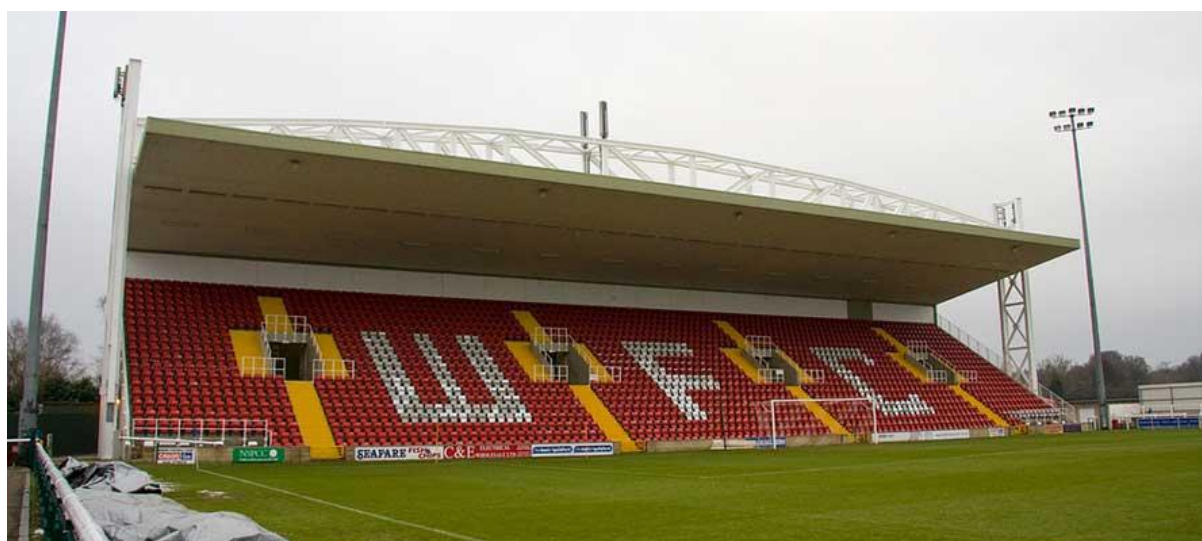
The Main Stand