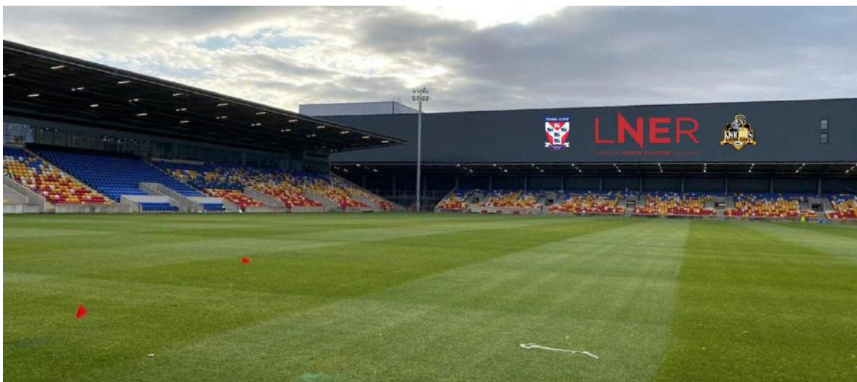
Main Stand & South (Cinema End)

The stadium has all-seated capacity of 8,000, it comprise four stands; the East Stand (Main Stand), the West Stand, the North Stand and the South Stand. The three-floored East Stand is to accommodate hospitality guests, players, officials and the media, and will be connected to the adjacent retail and community facilities.