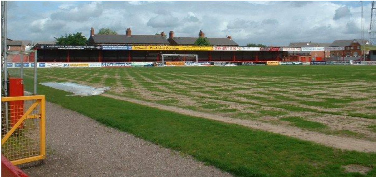
Golf Road End

At the roundabout, take the third exit onto Altrincham Rd/A560 at the second roundabout take a left into Thorley Lane then after one roundabout take the second on the right into Grove Road and at the crossroads take a right into Moss Lane the ground is on the left. There is limited parking at the ground so find a place in the local streets around the ground.