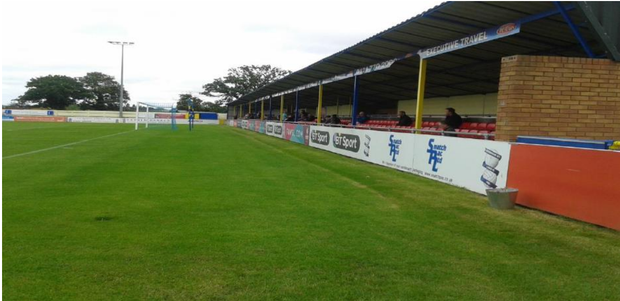
TC Cars End

Crossover next set of traffic lights and continue straight on along Damson Parkway. Go past BUPA Parkway Hospital and follow for just over 1 mile to the roundabout at Land Rover Works. Turn right at the roundabout and the ground entrance is 100 yards on your left. This is just under a mile walk and can be done in 18 mins.