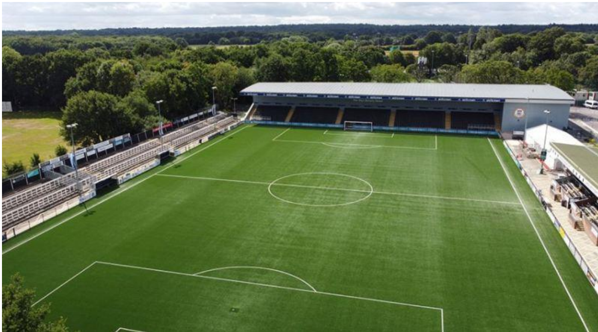
The new Enclosure

The nearest station to the ground is Bromley South Railway Station but if your train going into London goes via East Croydon Railway Station it may be easier to get off there and catch the 119 bus to the ground (approximate journey time: 40 minutes).