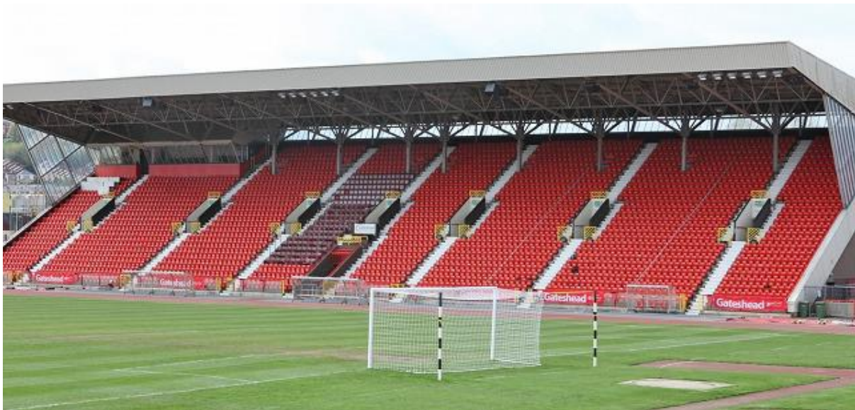
Tyne & Wear Stand

The location of away supporters is depending on the size of the away support. If they have a big support then they are housed in the East Stand for smaller supports then they are usually housed in North End of the Tyne & Wear Main Stand.