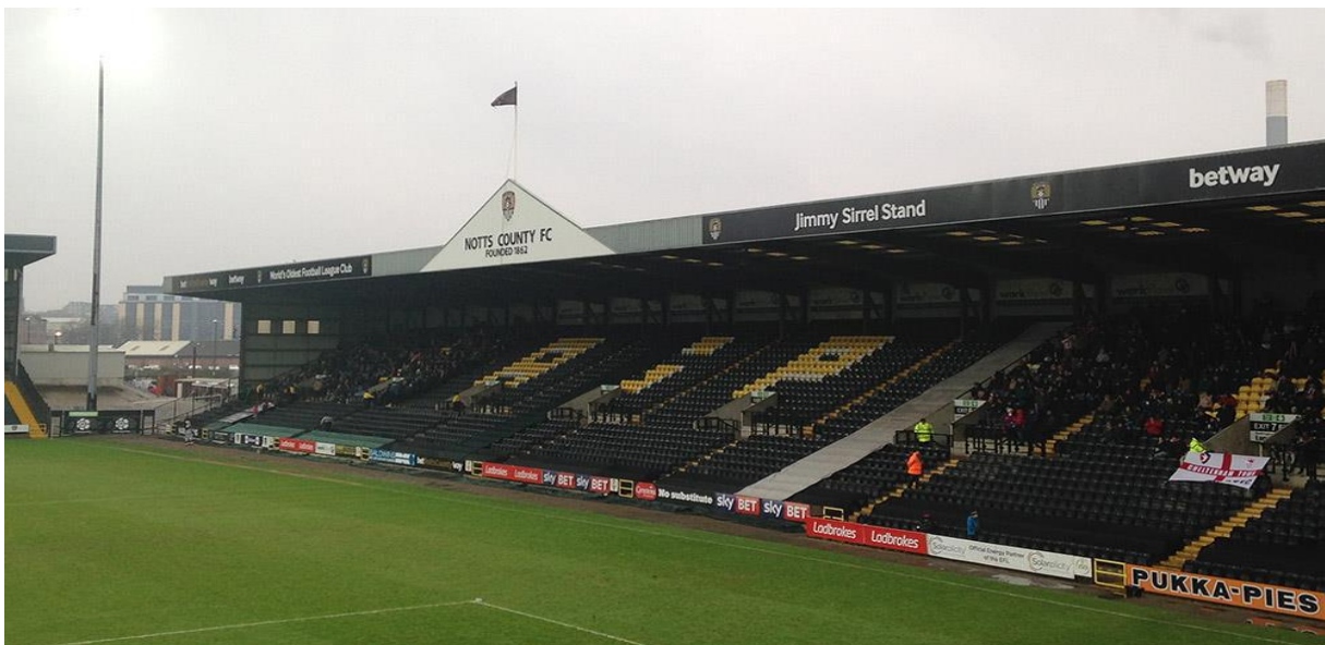
Jimmy Sirrel Stand

At one end is the large Kop Stand, which can house up to 5,400 supporters. Again this is a newish stand with excellent facilities. The other end is the smaller, covered Family Stand. This stand has one sizeable solitary supporting pillar, (although a structural point this bad design flaw in the stand) this can affect your view as it is situated right at the front of the stand in the middle. This stand also has a small electric scoreboard on its roof.