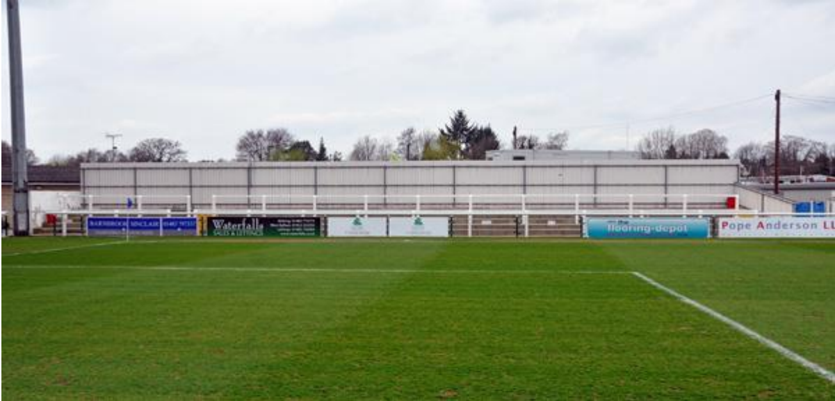
Chris Lane Terrace

turn left onto Kingfield Road and the entrance to the ground is down on the right opposite the Leisure Centre.