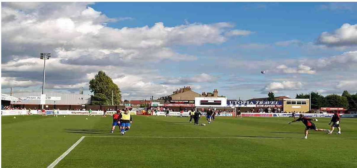
Bury Road End

The North Terrace, which runs along one side of the pitch, is known affectionately by the Dagenham fans as 'The Sieve' as apparently at one time it was famed for its leaking roof. This old fashioned looking terrace is partly covered to the rear and has a number of supporting pillars. It also has a television gantry perched upon its roof. Unusually the teams emerge from not from the main stand, but from a tunnel located in the new Marcus James Stand at one end of the ground.