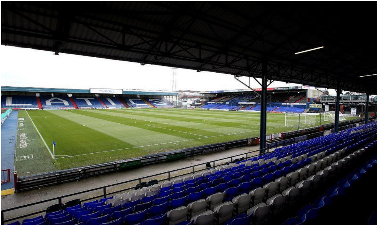
Vernon and George Hill Stands

This used to have a paddock terracing in front, but has since been filled with seating. There is still some old unused terracing on the right side of this stand. The ground also benefits from four large traditional floodlight pylons.