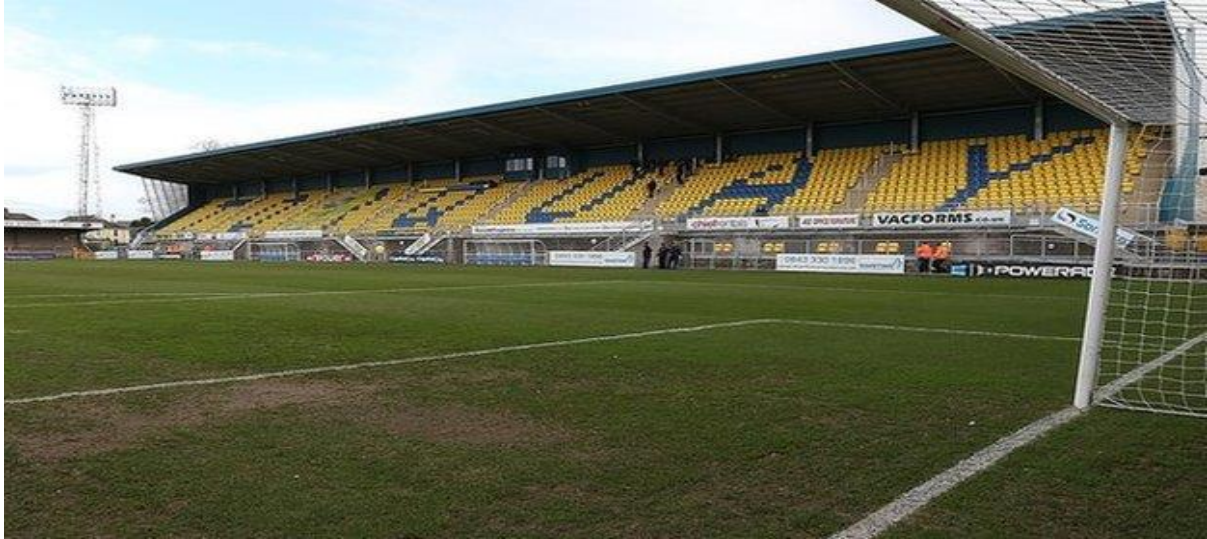
Main Stand (Bristow Bench)

windshields to either side situated below an elevated roof. The stand is raised above pitch level meaning that spectators have to climb a small staircase to enter it.