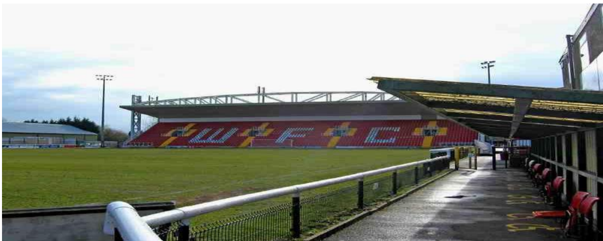
Leslie Gosden Stand from the Tennis Courts

The ground has an impressive and has a capacity for 6,000 and a modern looking single tiered stand at one end of the ground called the Leslie Gosden Stand, towers above the rest of the stadium. At the other end is a small covered terrace, called the Kingfield Road End, whilst on one side there is a small open terrace, called the Chris Lane Terrace. On the other side are a couple of small covered seated stand, with terracing beside the, called the Moaners End one nice feature is the abundance of greenery, with lots of trees surrounding the stadium.