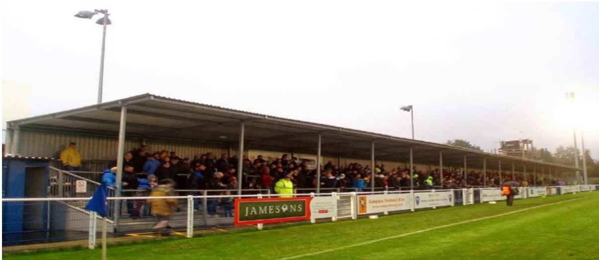
East Terrace Hampshire wanderer

From junction 13 of M3, turn right into Leigh Road, turn right at Holiday Inn, at mini roundabout take second exit, at the next mini roundabout take second exit, then next mini roundabout take first exit. Then take the first turning right (signposted) the ground is 200 metres on the left.