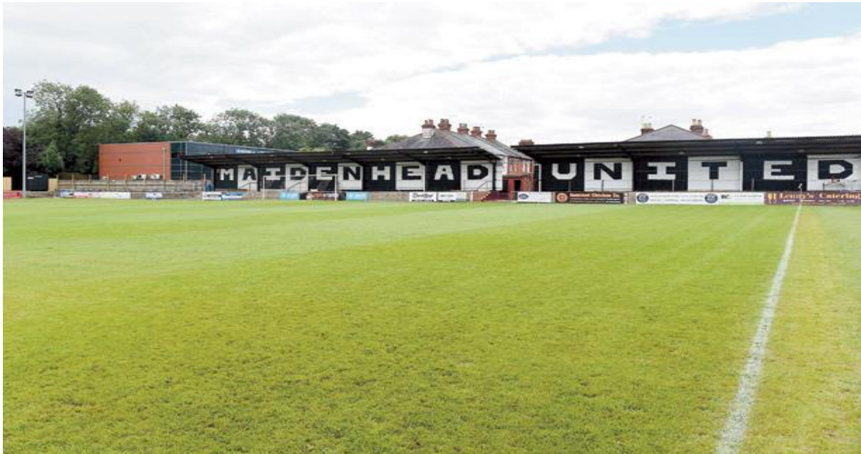
Bell Street End

Turn left into Broadway and park the car there. Come out of the car park walk through the shopping centre and turn left go past the Greyhound Pub when you get to the Honeypot Arms pub turn right and walk down York Road the ground is on the right, down the lane just before the Bowling Green